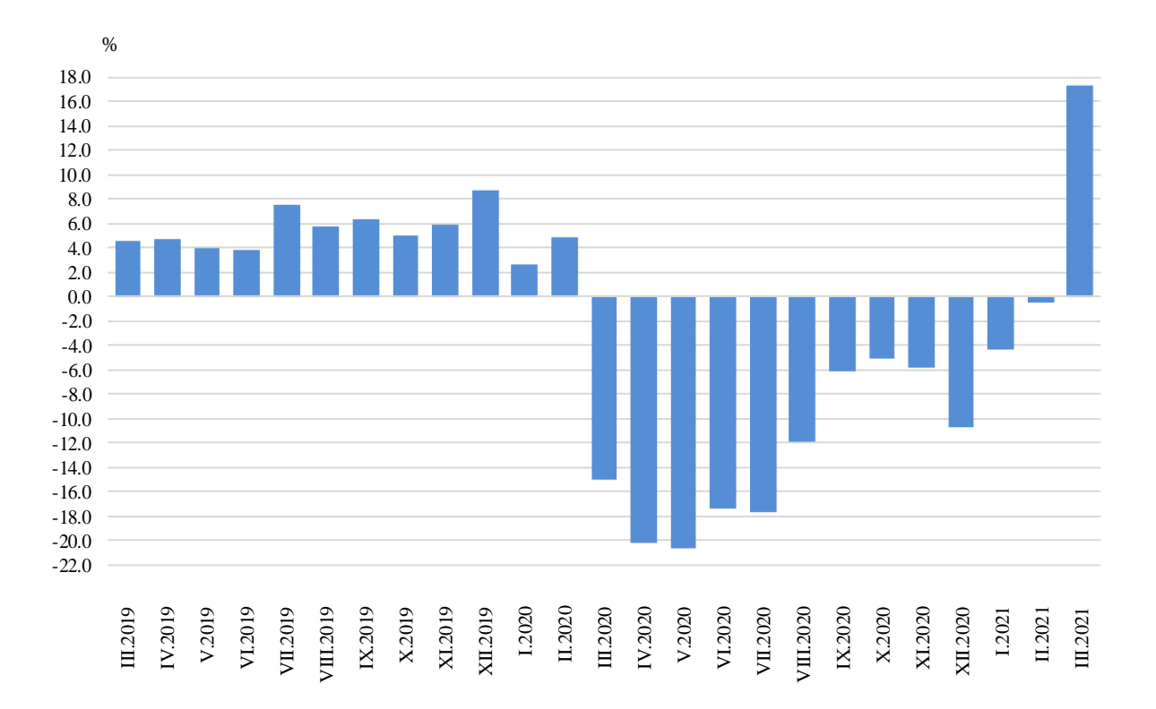
Figure 3. Change of turnover in 'Retail trade, except of motor vehicles and motorcycles' compared to the same month of the previous year (Working day adjusted)

More considerable growth of turnover in the 'Retail sale of non-food products, except fuel' was registered in the 'Retail sale of textiles, clothing, footwear and leather goods in specialised stores' - by 131.3%, the 'Retail sale of computers, peripheral units and software; telecommunications equipment'- by 70.8%, in the 'Retail sale via mail order houses or via Internet' - by 45.0%, and in the 'Retail sale of audio and video equipment; hardware, paints and glass; electrical household appliances' - by 31.9%.