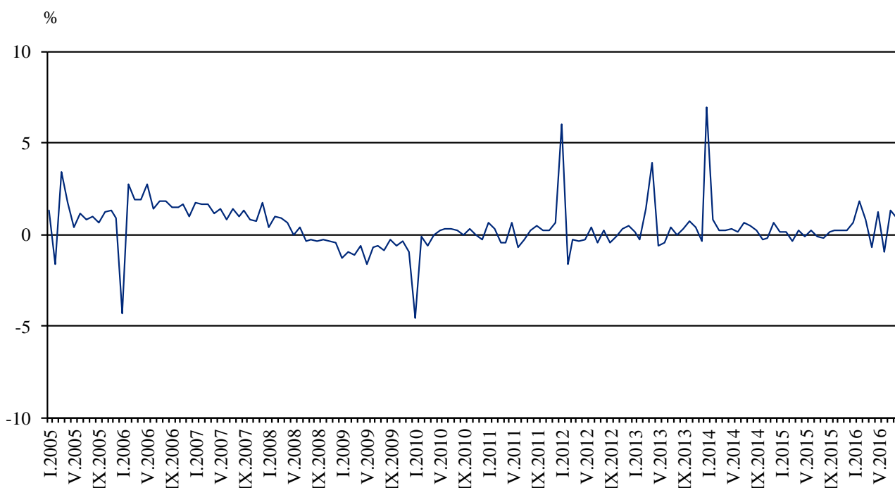
Figure 2. Change of turnover in ‘Retail trade, except of motor vehicles and motorcycles’ compared to the previous month (Seasonally adjusted)

In August 2016 compared to the previous month the turnover increased in the ‘Retail sale via mail order houses or via Internet’ by 9.4%, in the ‘Retail sale of computers, peripheral units and software; telecommunications equipment’ by 3.9%, in the ‘Dispensing chemist; retail sale of medical and orthopaedic goods, cosmetic and toilet articles’ by 2.8%, in the ‘Retail sale of textiles, clothing, footwear and leather goods’ by 2.7% and in the ‘Retail sale of audio and video equipment; hardware, paints and glass; electrical household appliances’ by 1.1%. A decrease was registered in the ‘Retail sale of food, beverages and tobacco’ - 0.5%, in the ‘Retail sale of automotive fuel’ - 0.2% and in the ‘Retail sale in non-specialised stores’ - 0.1%.