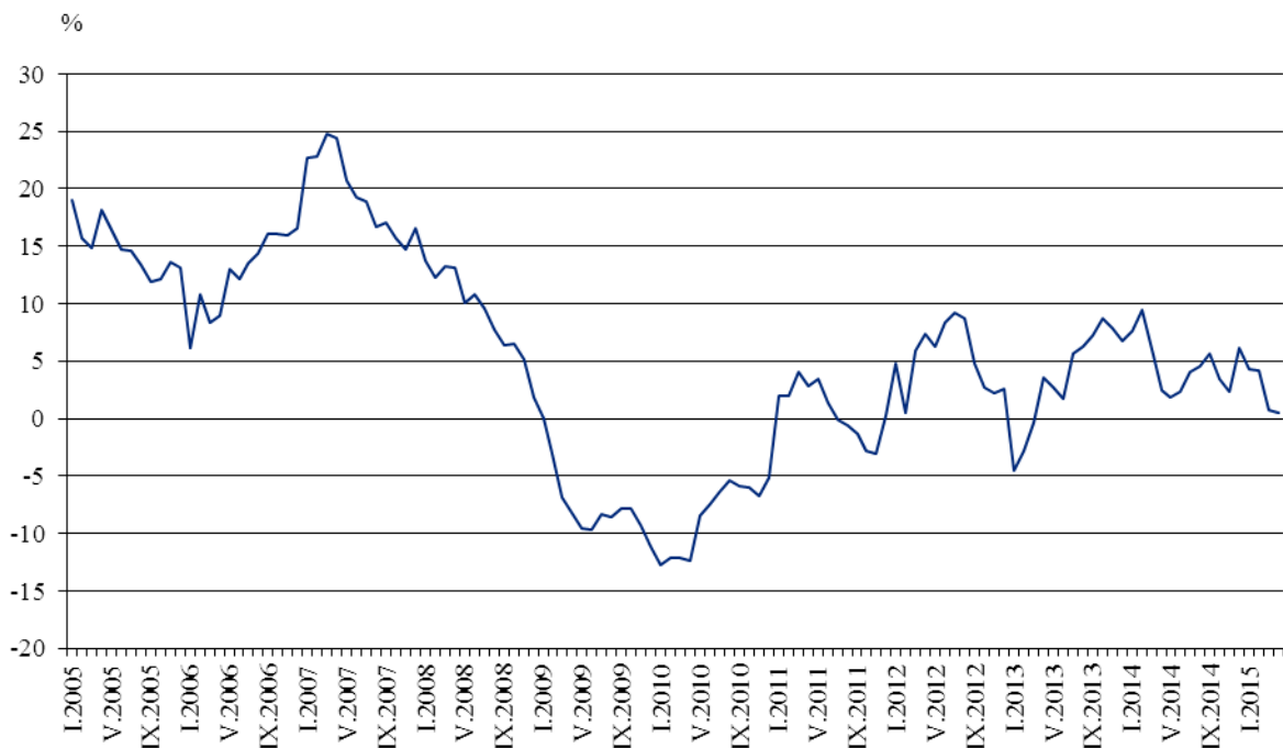
Figure 3. Change of turnover in 'Retail trade, except of motor vehicles and motorcycles' compared to the same month of the previous year (Working day adjusted)

In April 2015 compared to the same month of 2014 the turnover increased more significantly in the 'Retail sale via mail order houses or via Internet' by 7.7%, in the 'Dispensing chemist; retail sale of medical and orthopaedic goods, cosmetic and toilet articles' by 5.6%, in the 'Retail sale of automotive fuel' by 3.7%, in the 'Retail sale of audio and video equipment; hardware, paints and glass; electrical household appliances' by 3.3%. A drop was registered in the 'Retail sale of textiles, clothing, footwear and leather goods' - 4.5%, in the 'Retail sale of computers, peripheral units and software; telecommunications equipment' - 2.3%, in the 'Retail sale of food, beverages and tobacco' - 1.2%.