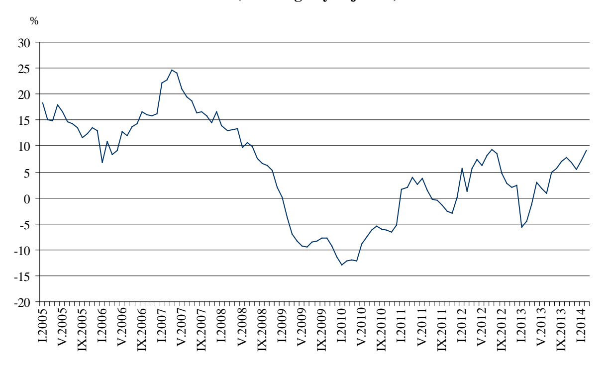
Figure 3. Change of turnover in 'Retail trade, except of motor vehicles and motorcycles' compared to the same month of the previous year (Working day adjusted)

In February 2014 compared to the same month of 2013 the turnover increased in almost all economic activities. More significant growth was observed in the 'Retail sale via mail order houses or via Internet' and in the 'Retail sale of computers, peripheral units and software; telecommunications equipment' - 18.5%, in the 'Retail sale of audio and video equipment; hardware, paints and glass; electrical household appliances' - 15.7% and in the 'Dispensing chemist; retail sale of medical and orthopaedic goods, cosmetic and toilet articles' - 11.9%. A drop of 1.6% was registered in the 'Retail sale of automotive fuel'.