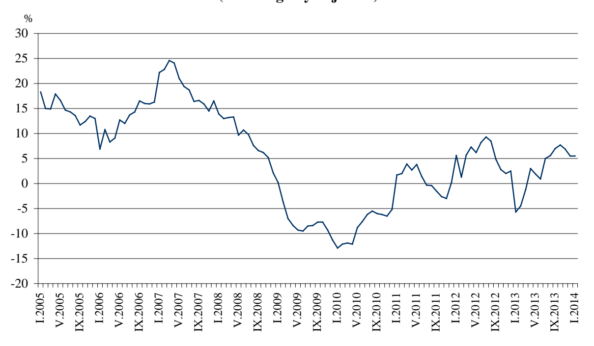
Figure 3. Change of turnover in 'Retail trade, except of motor vehicles and motorcycles' compared to the same month of the previous year (Working day adjusted)

In January 2014 compared to the same month of 2013 the turnover increased in all economic activities. More significant growth was observed in the 'Retail sale via mail order houses or via Internet' by 16.0%, in the 'Retail sale of computers, peripheral units and software; telecommunications equipment' by 13.8%, in the 'Retail sale of audio and video equipment; hardware, paints and glass; electrical household appliances' by 12.1% and in the 'Dispensing chemist; retail sale of medical and orthopaedic goods, cosmetic and toilet articles' by 9.8%.