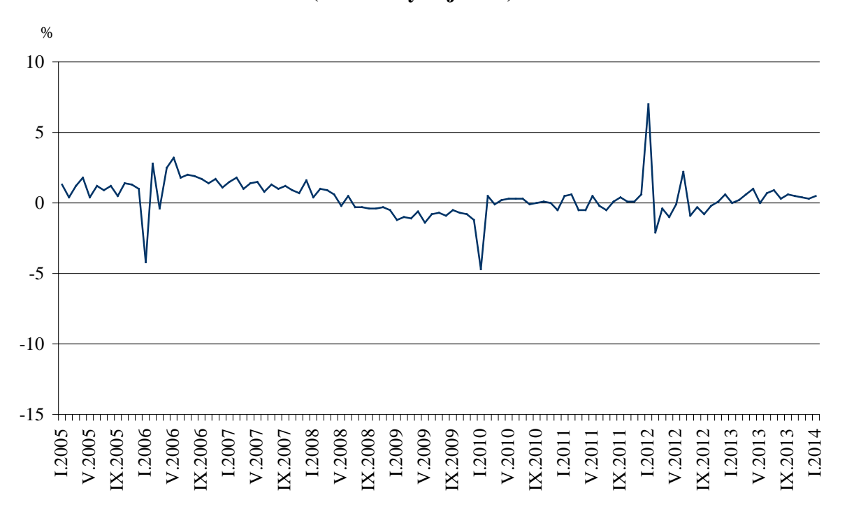
Figure 2. Change of turnover in 'Retail trade, except of motor vehicles and motorcycles' compared to the previous month (Seasonally adjusted)

In January compared to the previous month the turnover increased in the 'Retail sale of computers, peripheral units and software; telecommunications equipment' and in the 'Retail sale of automotive fuel' by 1.7%, in the 'Retail sale of audio and video equipment; hardware, paints and glass; electrical household appliances' by 0.5% and in the 'Dispensing chemist; retail sale of medical and orthopaedic goods, cosmetic and toilet articles' by 0.3%. A decrease was registered in the 'Retail sale via mail order houses or via Internet' by 6.5%, in the 'Retail sale of textiles, clothing, footwear and leather goods' by 1.3%, in the 'Other retail sale in non-specialised stores' and in the 'Retail sale of food, beverages and tobacco' by 1.2%.