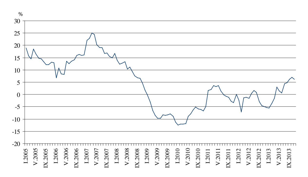
Figure 3. Change of turnover in 'Retail trade, except of motor vehicles and motorcycles' compared to the same month of the previous year (Working day adjusted)

In November 2013 compared to the same month of 2012 the turnover increased in almost economic activities. More significant growth was observed in the 'Retail sale of computers, peripheral units and software; telecommunications equipment' by 18.2%, in the 'Retail sale of audio and video equipment; hardware, paints and glass; electrical household appliances' by 15.1%, in the 'Other retail sale in non-specialised stores' by 10.7% and in the 'Retail sale of textiles, clothing, footwear and leather goods' by 9.5%. A decrease was observed only in the 'Retail sale of automotive fuel' by 3.0%.