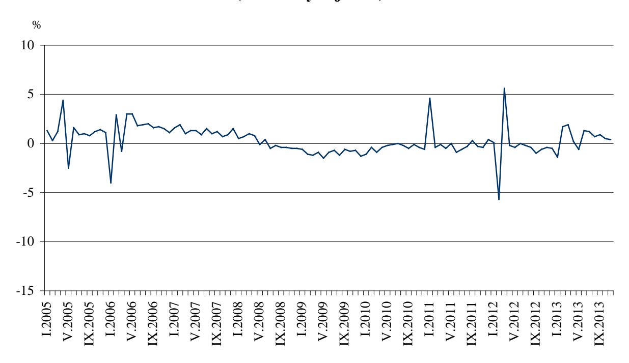
Figure 2. Change of turnover in 'Retail trade, except of motor vehicles and motorcycles' compared to the previous month (Seasonally adjusted)

In November compared to the previous month the turnover increased in the 'Retail sale of computers, peripheral units and software; telecommunications equipment' by 2.9%, in the 'Retail sale via mail order houses or via Internet' by 1.9%, in the 'Retail sale of audio and video equipment; hardware, paints and glass; electrical household appliances' by 1.6% and in the 'Other retail sale in non-specialised stores' by 1.1%. A decrease was registered in the 'Retail sale of textiles, clothing, footwear and leather goods' by 11.4%, in the 'Retail sale of automotive fuel' by 2.3%, in the 'Retail sale of food, beverages and tobacco' by 0.5% and in the 'Dispensing chemist; retail sale of medical and orthopaedic goods, cosmetic and toilet articles' by 0.3%.