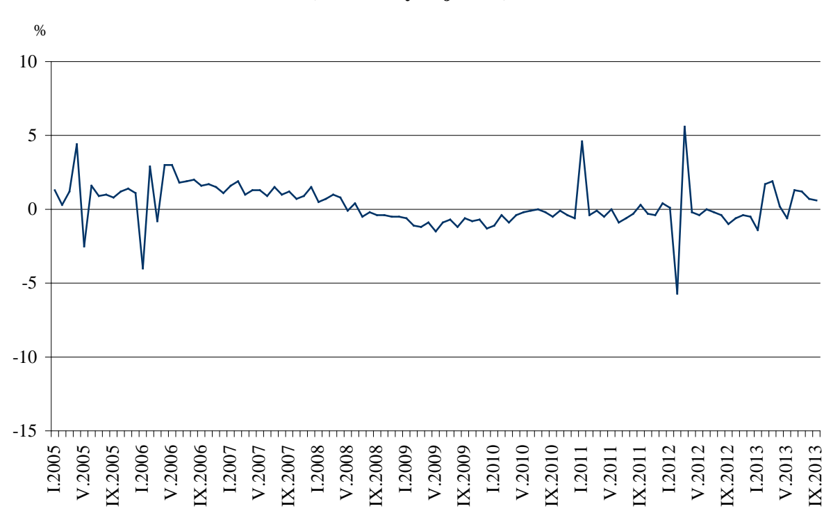
Figure 2. Change of turnover in 'Retail trade, except of motor vehicles and motorcycles' compared to the previous month (Seasonally adjusted)

In September compared to the previous month the turnover increased in the 'Retail sale of textiles, clothing, footwear and leather goods' by 2.7%, in the 'Retail sale via mail order houses or via Internet' by 2.1%, in the 'Other retail sale in non-specialised stores' by 1.6%, in the 'Retail sale of automotive fuel' by 1.5%, in the 'Retail sale of computers, peripheral units and software; telecommunications equipment' by 1.3% and in the 'Retail sale of audio and video equipment; hardware, paints and glass; electrical household appliances' by 0.5%. A decrease was registered in the 'Dispensing chemist; retail sale of medical and orthopaedic goods, cosmetic and toilet articles' by 0.7% and in the 'Retail sale of food, beverages and tobacco' by 0.6%.