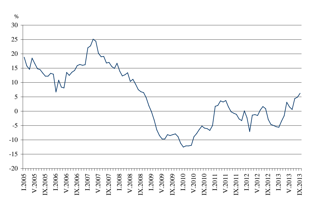
Figure 3. Change of turnover in 'Retail trade, except of motor vehicles and motorcycles' compared to the same month of the previous year (Working day adjusted)

In September 2013 compared to the same month of 2012 the turnover increased in all economic activities. More significant growth was observed in the 'Retail sale of textiles, clothing, footwear and leather goods' by 27.6%, in the 'Other retail sale in non-specialised stores' by 13.0%, in the 'Retail sale of food, beverages and tobacco' by 8.0%, in the 'Retail sale of automotive fuel' by 7.3%, in the 'Retail sale of audio and video equipment; hardware, paints and glass; electrical household appliances' by 5.0%.