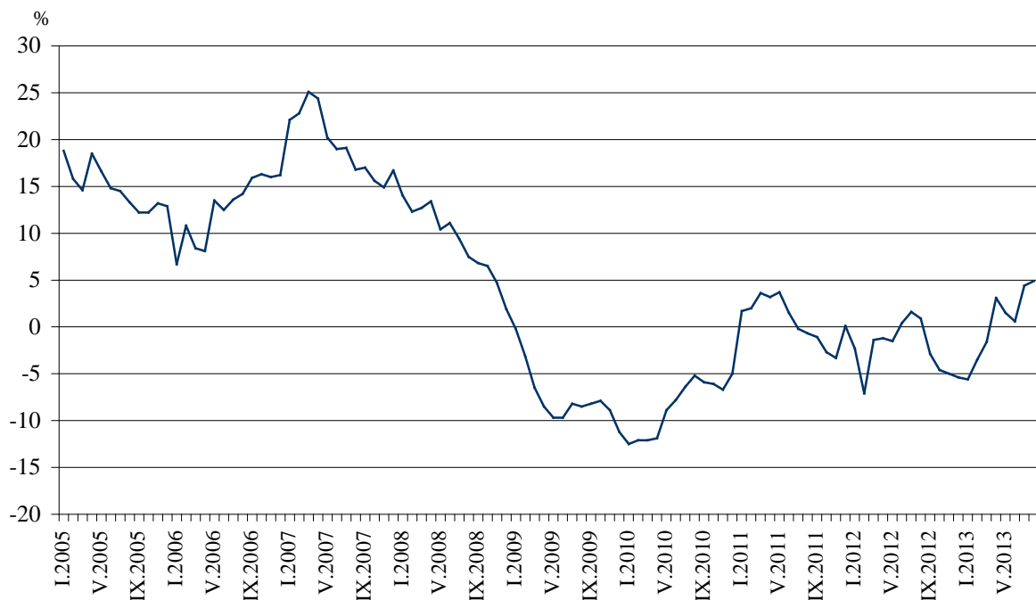
Figure 3. Change of turnover in 'Retail trade, except of motor vehicles and motorcycles' compared to the same month of the previous year (Working day adjusted)

In August 2013 compared to the same month of 2012 the turnover has increased more significantly in the 'Retail sale of textiles, clothing, footwear and leather goods' by 22.5%, in the 'Retail sale of food, beverages and tobacco' by 10.9%, in the 'Other retail sale in non-specialised stores' by 10.4%, in the 'Dispensing chemist; retail sale of medical and orthopaedic goods, cosmetic and toilet articles' by 3.2% and in the 'Retail sale of audio and video equipment; hardware, paints and glass; electrical household appliances' by 3.1%. A decrease was registered only in the 'Retail sale of computers, peripheral units and software; telecommunications equipment' by 5.4%.