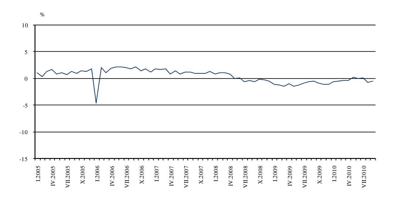
Figure 2. Percentage change of turnover in 'Retail trade, except of motor vehicles and motorcycles' compared to the previous month (Seasonally adjusted)

In comparison with the previous month the turnover in September 2010 increased negligibly in 'Retail sale of textiles, clothing, footwear and leather goods in specialised stores' - 0.5% and in 'Retail sale of food, beverages and tobacco' - 0.3%. In all other activities drops were observed, which reached to 1.4% in 'Dispensing chemist; retail sale of medical and orthopaedic goods, cosmetic and toilet articles in specialised stores' and 0.9% in 'Retail sale of automotive fuel in specialised stores'.