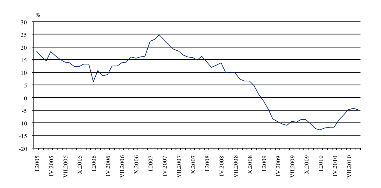
Figure 3. Percentage change of turnover in 'Retail trade, except of motor vehicles and motorcycles' compared to the same month of the previous year (Working day adjusted)

The turnover in September 2010 fell by 4.7% compared to the same month of the previous year. Negligible drop was registered in 'Retail sale of food, beverages and tobacco' - 0.2%. In 'Dispensing chemist; retail sale of medical and orthopaedic goods, cosmetic and toilet articles in specialised stores' and in 'Retail sale of computers, peripheral units and software; telecommunications equipment, etc. in specialised stores' the reduction attained 9.8% and 9.4% respectively. In 'Retail sale of automotive fuel in specialised stores' the decline was closer to the average rate of the division - 5.1%.