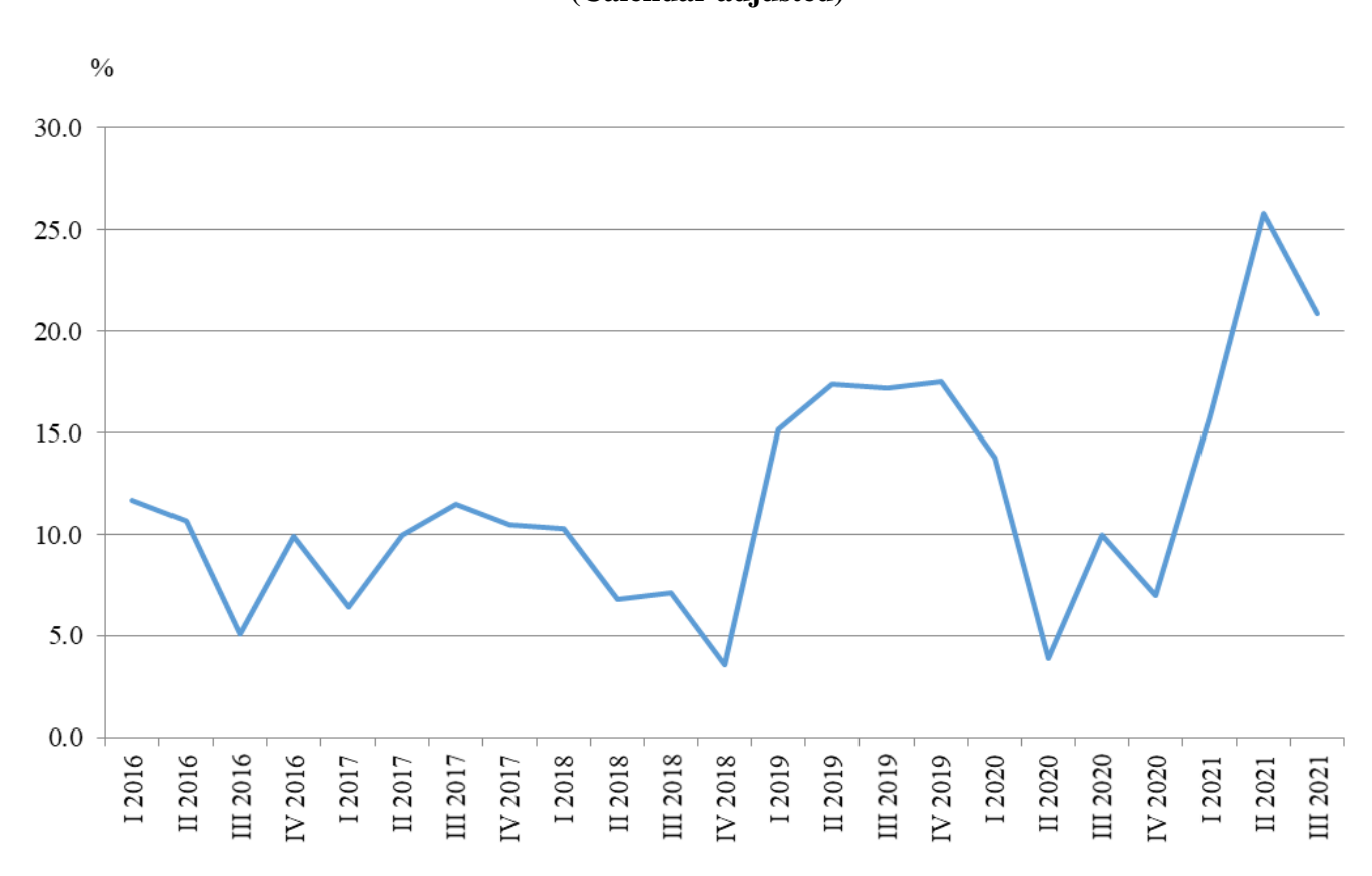
Figure 3. Changes of the turnover index in 'Information and communication' compared to the same quarter of the previous year (Calendar adjusted)

In 'Other business services' the largest growth compared to the third quarter of 2020 was observed in Travel agency, tour operator and other reservation service and related activities - by 158.6% and Architectural and engineering activities; technical testing and analysis - by 48.3%.