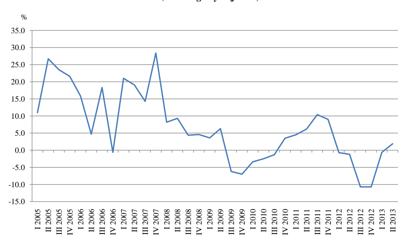
Figure 3. Change of the turnover index in "Information and communication" compared to the same quarter of the previous year (Working day adjusted)

In "Other business services" the biggest growth in comparison with the same quarter of 2012 was observed in Office administrative, office support and other business support activities – by 38.4% and in Employment activities – by 23.8%. Drop of index was registered in Cleaning activities – by 22.3%.