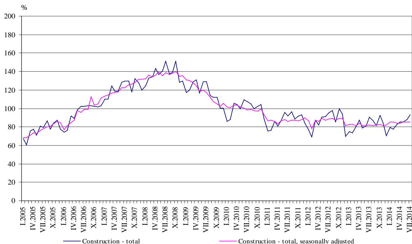
Figure 1. Construction Production Indices (2010 = 100)

In July 2014 working day adjusted data 4 showed an increase by 2.9% in the construction production, compared to the same month of 2013 (Table 4).