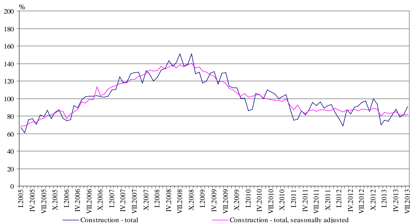
Figure 1. Construction Production Indices (2010 = 100)

In July 2013 working day adjusted data 4 showed a decrease by 6.8% in the construction production, comparing to the same month of 2012 (Table 4).