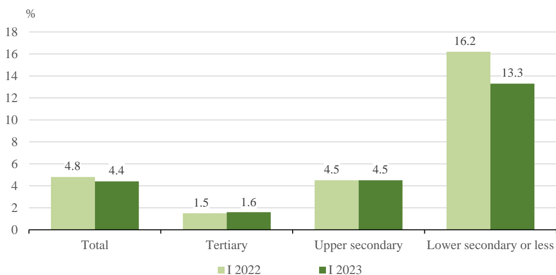
Figure 1. Unemployment rates by level of education in the first quarter of 2022 and 2023

Among all unemployed persons, 12.4% had attained tertiary education, 57.7% had completed upper secondary education and 30.0% had at most lower secondary education. The unemployment rate by level of educational attainment was as follows: 1.6% for tertiary education, 4.5% for upper secondary education and 13.3% for lower education (lower secondary or less).