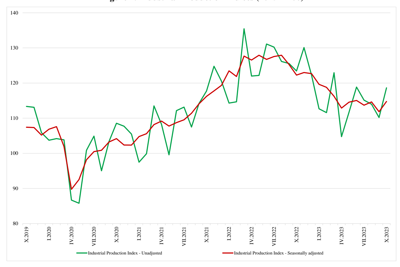
Figure 1. Industrial Production Indices (2015 = 100)

In comparison with October 2022, a decline of 5.4% was registered in the calendar-adjusted<sup>4</sup> Industrial Production Index.