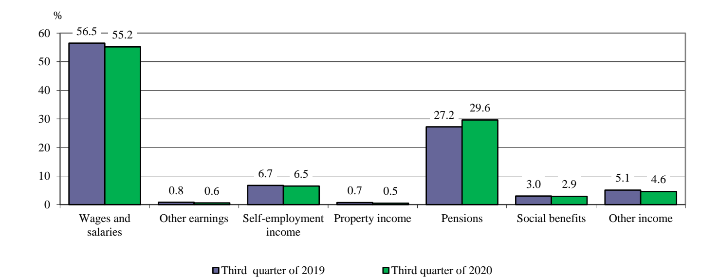
Figure 1. Structure of the total household income during the third quarter of 2019 and 2020

The highest relative share of income within the total income is this from wages and salaries (55.2%). The relative share of income from pensions is 29.6% and from self-employment - 6.5%. Compare to the third quarter of 2019 the relative share of income from pensions increases by 2.4 percentage points (pp), income from wages and salaries decreases by 1.3 pp and income the self-employment and other earnings decrease by 0.2 pp.