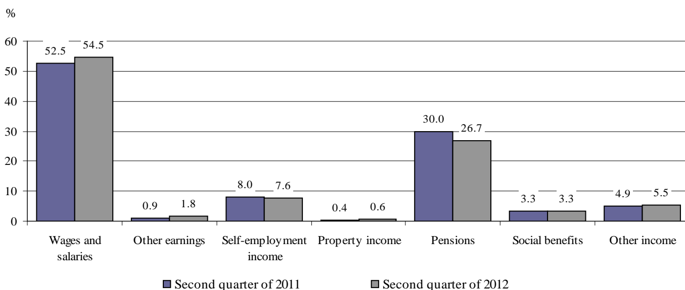
Figure 1. Structure of the total household income in the second quarter of 2011 and 2012

The relative share of monetary income into the total income in the second quarter of 2012 was similar in comparison with the same quarter of 2011 and was 98.1%.