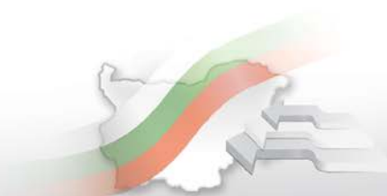
Table 3 Exports, imports and trade balance by groups of countries and main trade partners 1 of Bulgaria in January 2012 2 and 2013 2