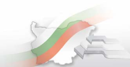
Fig.1 CHILDREN IN THE HOMES FOR MEDICO-SOCIAL CARE FOR CHILDREN PER 1 000 OF TOTAL POPULATION AGED UP TO 3 COMPLETED YEARS