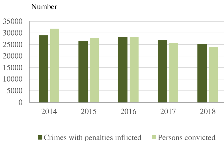
Figure 1. Crimes with penalty inflicted and persons convicted during the period of 2014 - 2018

The number of persons convicted with penalties came into force was 23 973 in 2018. Compared to 2017 the number of persons convicted decreased by 7.1%.