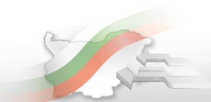
Table 5 Persons convicted with sentences came into force by penalties imposed (Number)