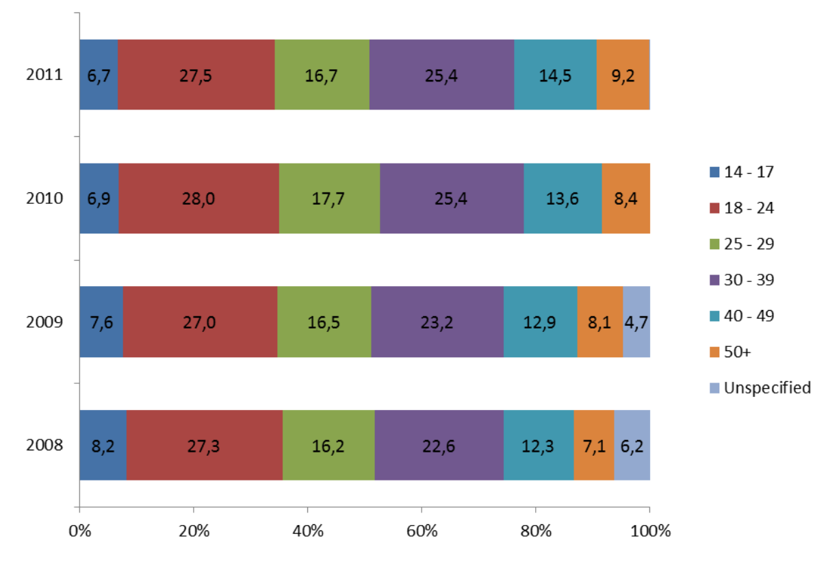
Fig. 2. Persons convicted by age