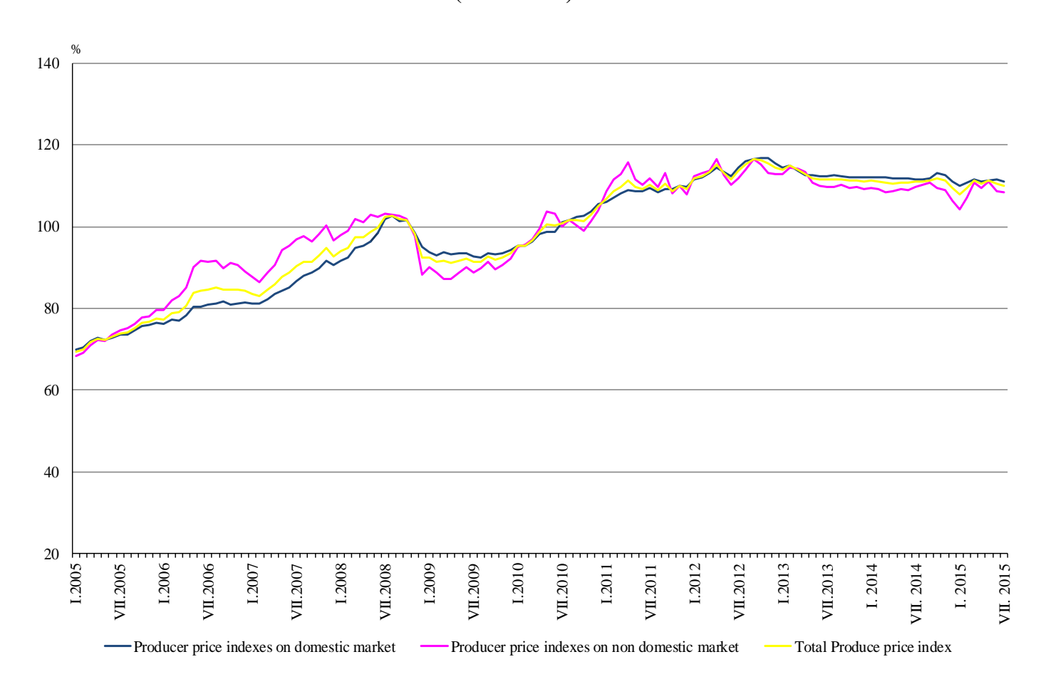
Figure 2. Total Producer Price Indices in Industry (2010 = 100)

In the manufacturing, the prices fell by 2.4% compared to July 2014. More significant prices decreases were seen in the manufacture of other non-metallic mineral products by 0.8%, in the manufacture of beverages by 0.4% and in the manufacture of food products by 0.2%, while the producer prices went up in the manufacture of other transport equipment by 7.7%, in the manufacture of textiles by 6.3% and in the manufacture of chemicals and chemical products by 5.6%.