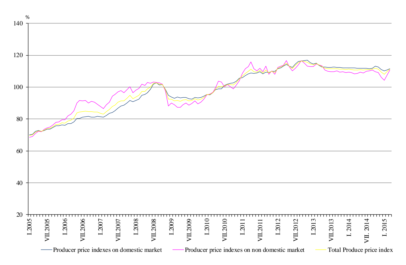
Figure 2. Total Producer Price Indices in Industry (2010 = 100)

In the manufacturing, the prices fell by1.0% compared to March 2014. More significant prices decreases were seen in the manufacture of food products by 1.0%, in the manufacture of other non-metallic mineral products by 0.5%, while the producer prices went up in the manufacture of basic metals by 11.7%, in the manufacture of other transport equipment by 9.5% and in the manufacture of textiles by 5.8%.