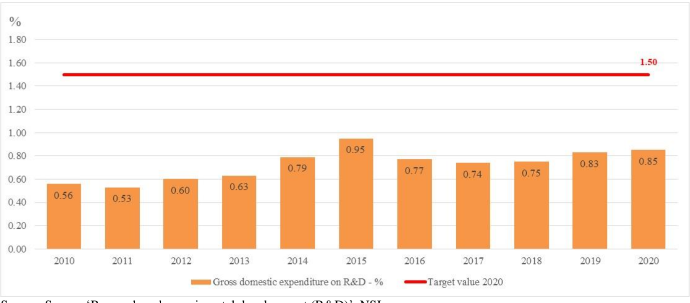
Fig. 2. Gross domestic expenditure on R&D<sup>2</sup>