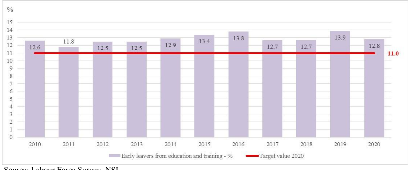
Fig. 4. Early leavers from education and training<sup>2</sup>