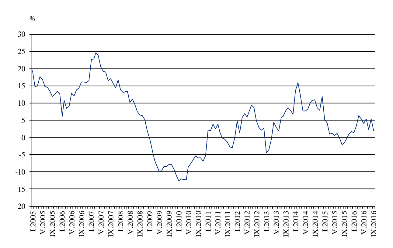
Figure 3. Change of turnover in 'Retail trade, except of motor vehicles and motorcycles' compared to the same month of the previous year (Working day adjusted)

In September 2016 compared to the same month of 2015 the turnover increased in the 'Retail sale of textiles, clothing, footwear and leather goods' by 14.5%, in the 'Retail sale of food, beverages and tobacco' by 7.0%, in the 'Dispensing chemist; retail sale of medical and orthopaedic goods, cosmetic and toilet articles' and in the 'Retail sale via mail order houses or via Internet' by 6.2%. More significantly decrease was registered in the 'Retail sale of computers, peripheral units and software; telecommunications equipment' - 4.8% and in the 'Retail sale of audio and video equipment; hardware, paints and glass; electrical household appliances' - 4.2%.