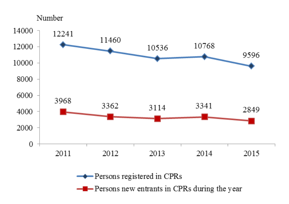
Figure 1. Minors and juveniles, registered and new entrants (for the first time) during the year in the Child pedagogic rooms between 2011 and 2015