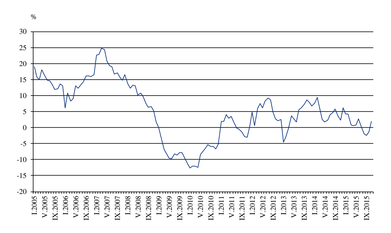
Figure 3. Change of turnover in 'Retail trade, except of motor vehicles and motorcycles' compared to the same month of the previous year (Working day adjusted)

In November 2015 compared to the same month of 2014 the turnover increased in the 'Retail sale via mail order houses or via Internet' by 16.3%, in the 'Dispensing chemist; retail sale of medical and orthopaedic goods, cosmetic and toilet articles' by 9.4%, in the 'Retail sale in non-specialised stores' by 6.6%, in the 'Retail sale of computers, peripheral units and software; telecommunications equipment' by 4.7%, in the 'Retail sale of audio and video equipment; hardware, paints and glass; electrical household appliances' by 3.6% and in the 'Retail sale of automotive fuel' by 3.5%. Decrease was registered in the 'Retail sale of textiles, clothing, footwear and leather goods' - 7.7% and in the 'Retail sale of food, beverages and tobacco' - 1.8%.