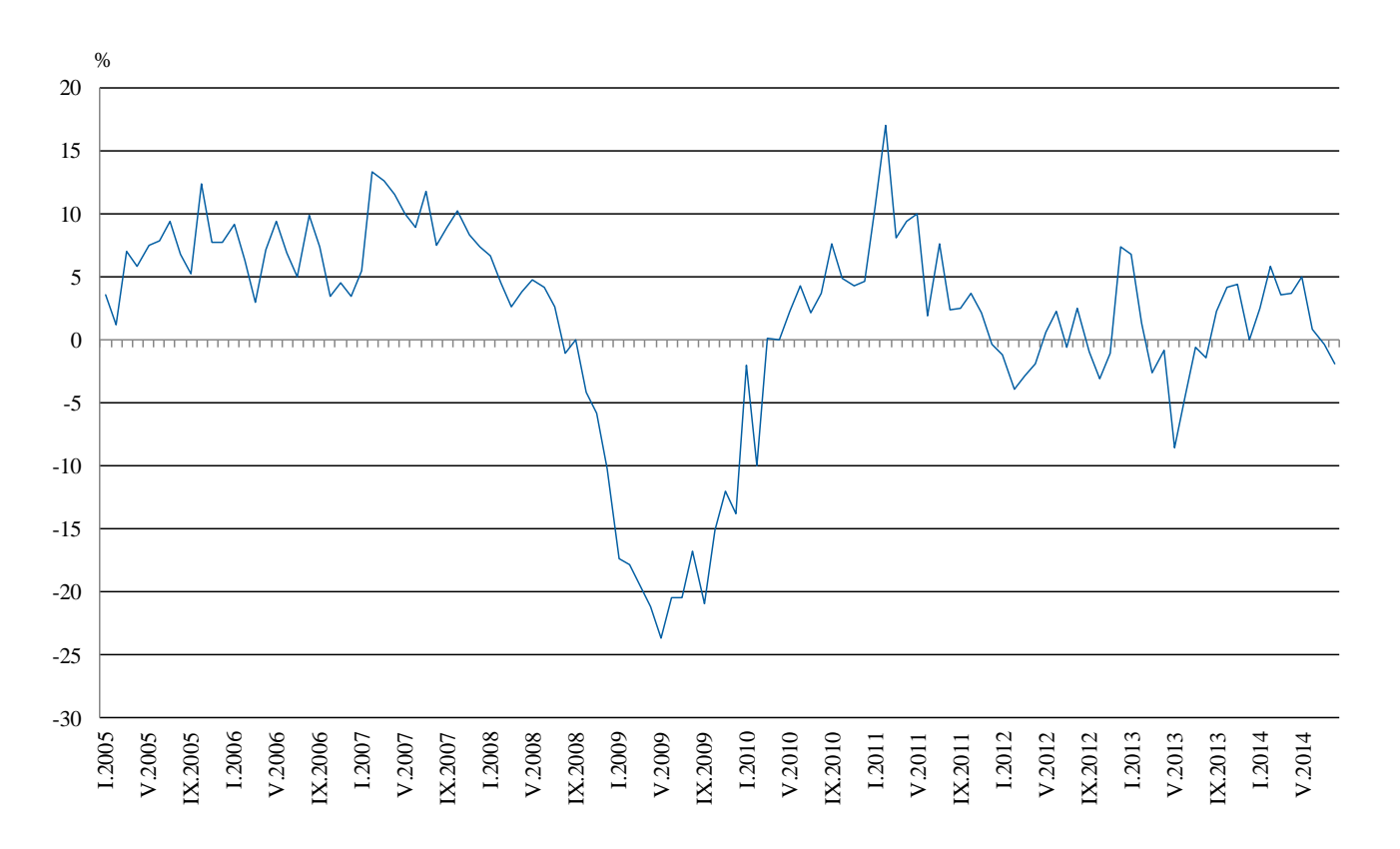
Figure 3. Changes of Industrial Production Indices compared to the same month of the previous year (Working day adjusted)

The final data on Industrial Production and Turnover Indices for July 2014 can be found on the NSI website: <a href="http://www.nsi.bg/en">http://www.nsi.bg/en</a>.