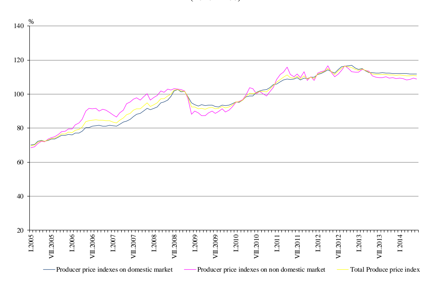
Figure 2. Total Producer Price Indices in Industry (2010 = 100)

In the manufacturing, the prices remained at the level the same month of 2013. More significant prices decreases were seen in the manufacture of basic metals by 5.7%, in the manufacture of food products by 4.4% and in the manufacture of chemicals and chemical products by 4.0%, while the producer prices rose in the manufacture of tobacco products by 4.9%, in the manufacture of beverages and in the manufacture of furniture by 2.2%.