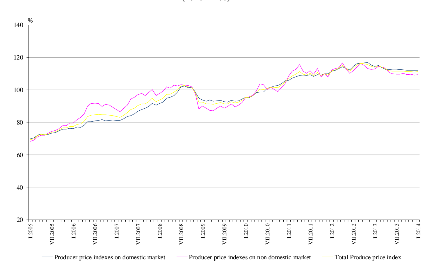
Figure 2. Total Producer Price Indices in Industry (2010 = 100)

In the manufacturing, the prices fell by 1.1% as compared to January 2013. More significant prices decreases were seen in the manufacture of basic metals by 8.7%, in the manufacture of food products by 4.4% and in the manufacture of motor vehicles, trailers and semi-trailers by 2.1%, while the producer prices rose in the manufacture of tobacco products by 5.3%, in the manufacture of wearing apparel and in the manufacture of leather and related products by 2.9%