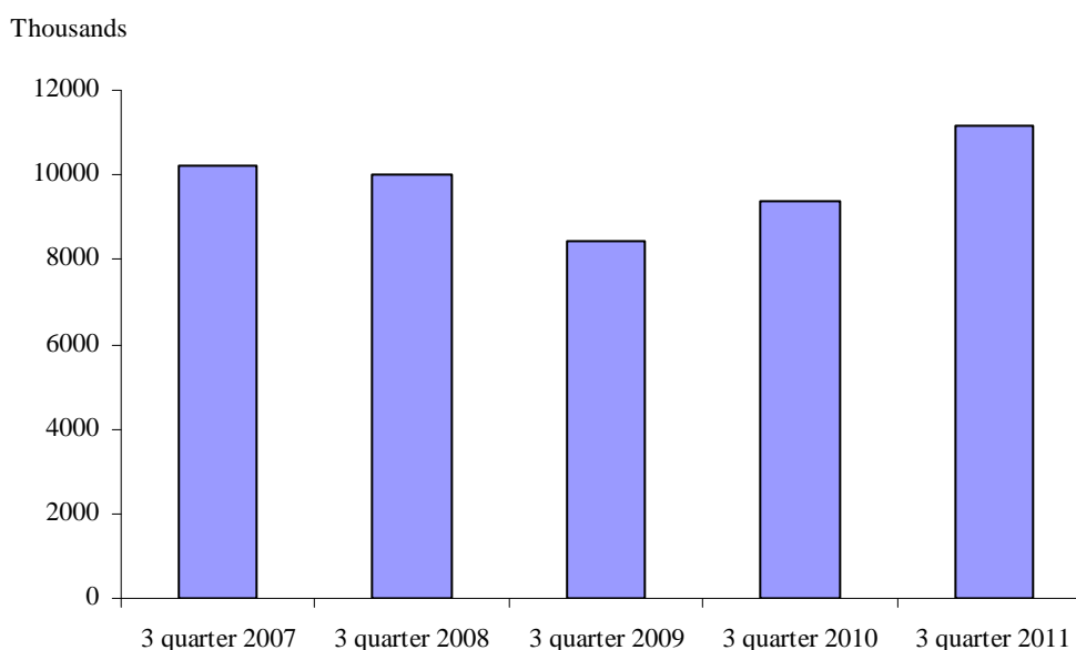
Figure 1. Nights spent in accommodation establishments in the third quarter during the 2007 - 2011 period

In the third quarter of 2011, the number of nights spent by Bulgarian citizens in accommodation establishments was 2 972.6 thousand and increased by 361.4 thousand (13.8%) compared to the same quarter of 2010. The number of the nights spent by foreigners in accommodation establishments increased by 20.8%. More nights were spent by the residents of the following countries: China - by 111.7%, Lithuania - by 84.1%, Latvia - by 82.0%, Ukraine - by 74.2%, Malta - by 73.0%, Luxembourg - by 71.3%, South Africa - by 68.0%, Slovakia - by 60.5%, Hungary - by 59.9%, Australia - by 54.3%, FYROM - by 40.9%, Romania - by 39.4%, Czech Republic - by 38.2%, Ireland - by 35.8%, etc. A decrease in the nights spent in accommodation establishments by foreigners was observed from Brazil - by 80.4%, Portugal - by 24.5%, Estonia - by 20.1%, Japan - by 17.5%, Spain - by 16.2%, etc.