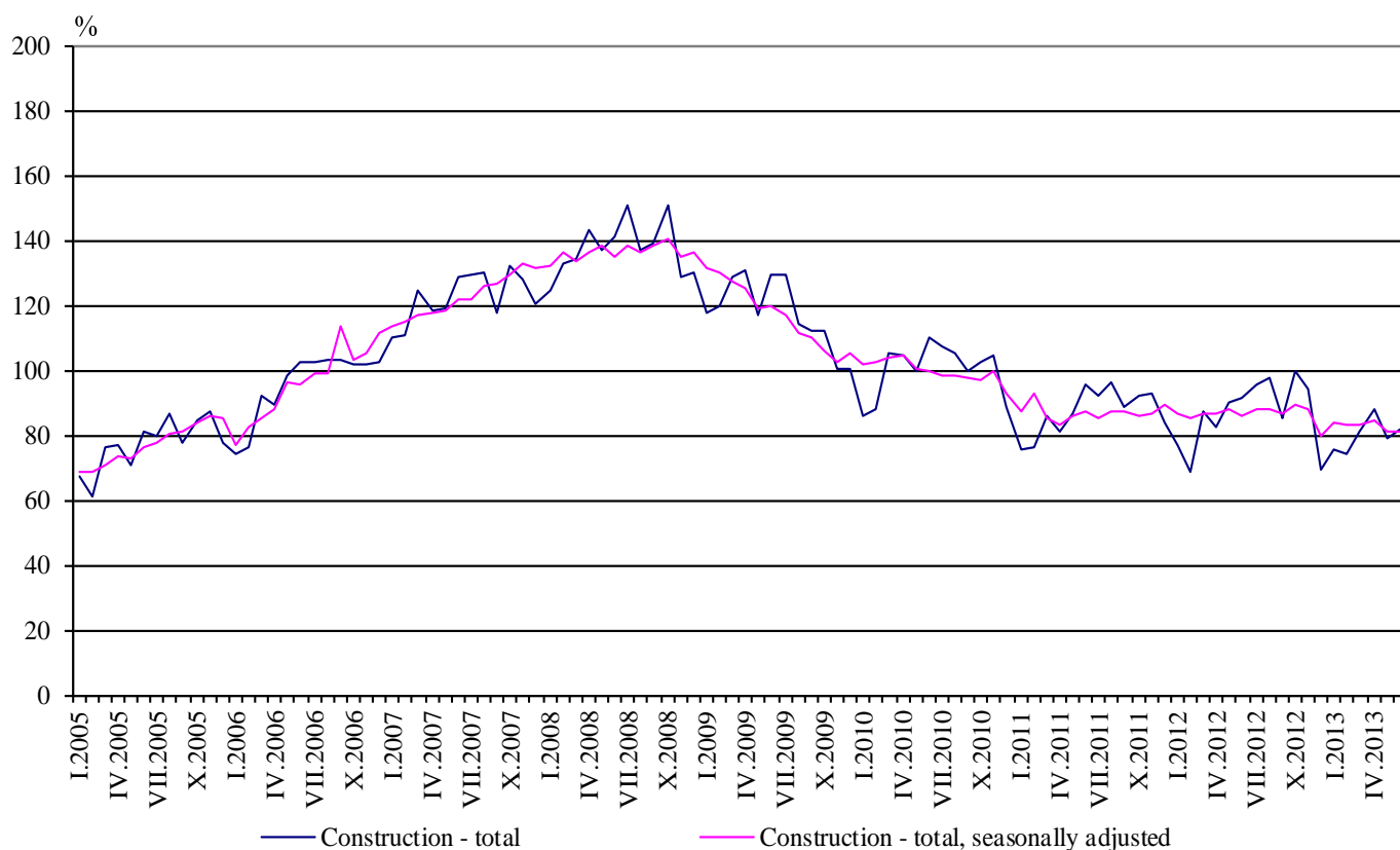
Figure 1. Construction Production Indices (2010 = 100)

In June 2013 working day adjusted data 4 showed a decrease by 8.8% in the construction production compared to the same month of 2012 (Table 4).