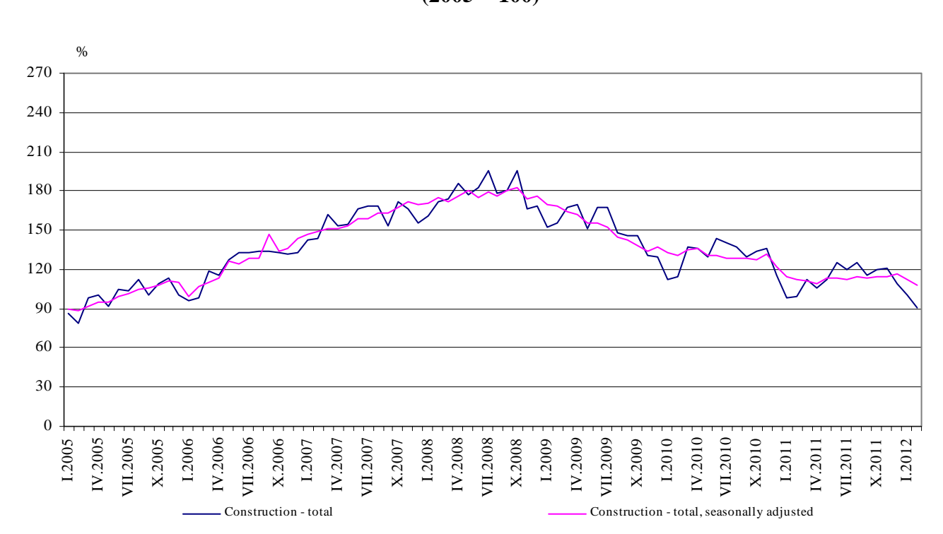
Figure 1. Construction Production Indices (2005 = 100)

In February 2012 working day adjusted data<sup>4,5</sup> showed a decrease by 10.0% in the construction production, comparing to the same month of 2011 (Table 4).