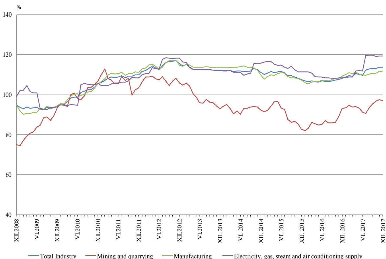
Figure 2. Producer Price Indices on Domestic Market in Industry (2010 = 100)

In the manufacturing compared to December 2016 the prices went up in the manufacture of wood and of products of wood and cork, except furniture, manufacture of articles of straw and plaiting materials by 6.3%, in the manufacture of chemicals and chemical products by 4.5% and in the manufacture of motor vehicles, trailers and semi-trailers by 3.4%. A decrease in the prices was reported in the manufacture of computer, electronic and optical products by 0.6% and in the manufacture of other non-metallic mineral products by 0.3%.