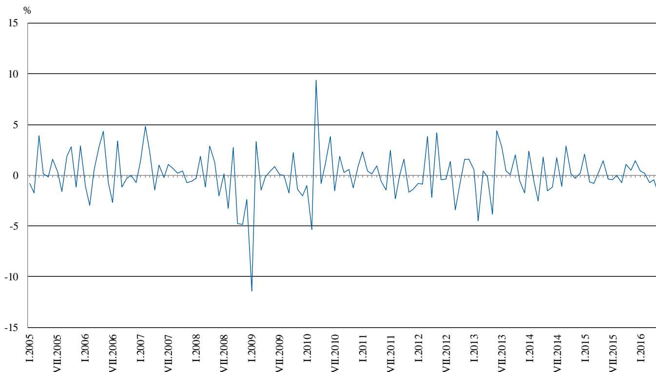
Figure 2. Changes of Industrial Production Indices compared to the previous month (Seasonally adjusted)

The most significant decreases of production in the manufacturing were registered in the manufacture of other transport equipment by 18.5%, in the manufacture of fabricated metal products, except machinery and equipment by 14.3%, in the manufacture of beverages and in the manufacture of tobacco products by 14.2%, in the manufacture of leather and related products by 8.3%. There were increases in the repair and installation of machinery and equipment by 4.7%, manufacture of motor vehicles, trailers and semi-trailers by 3.9%, in the manufacture of food products by 2.3%.