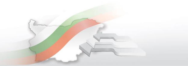
Exports, imports and trade balance of Bulgaria in the period January - July 2017 and 2018 1 by months