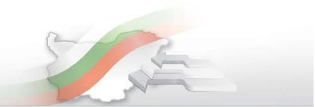
Exports, imports and trade balance of Bulgaria in the period January - June 2017 and 2018 1 by months