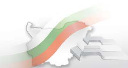
Table 4 Exports, imports and trade balance by groups of countries and main trade partners 1 of Bulgaria for the period January - February 2012 2 and 2013 2