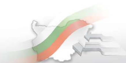
Table 3 Exports, imports and trade balance by groups of countries and main trade partners 1 of Bulgaria for the period January - February 2012 2 and 2013 2