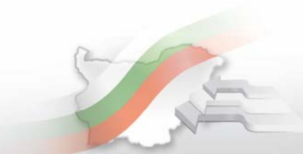
Exports, imports and trade balance by groups of countries and main trade partners 1 for the period January - May 2010 2 and 2011 2