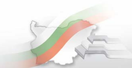
Table 2 EXPORTS, IMPORTS AND TRADE BALANCE BY GROUPS OF COUNTRIES AND MAIN TRADE PARTNERS 1 FOR THE PERIOD JANUARY - SEPTEMBER 2009 AND 2010 2