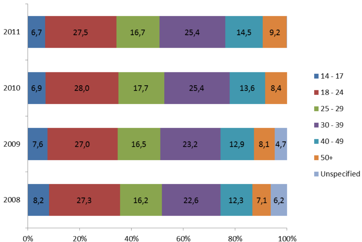
Fig. 2. Persons convicted by age