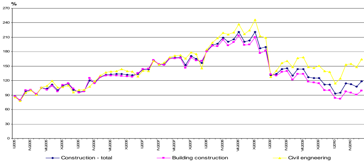
Figure 2. Construction Production Indices (2005 = 100) 3